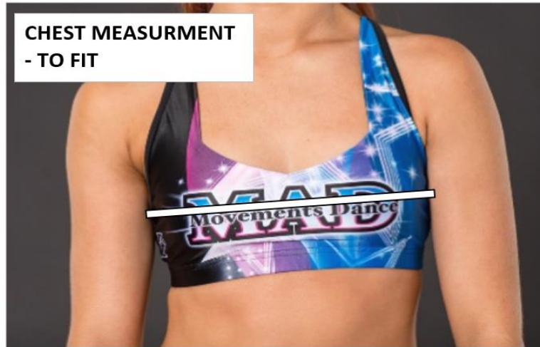
CHEST MEASUREMENT - TO FIT