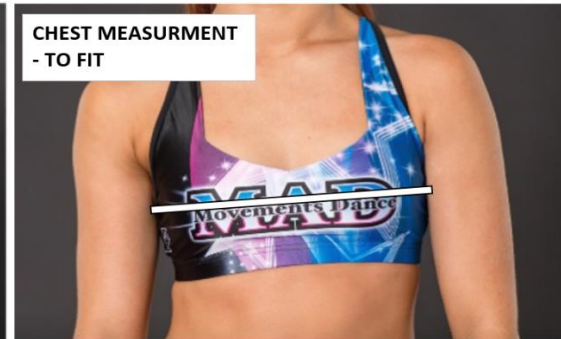
CHEST MEASUREMENT - TO FIT